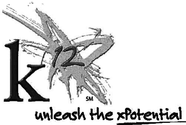
Exhibit B K12 Proprietary Marks