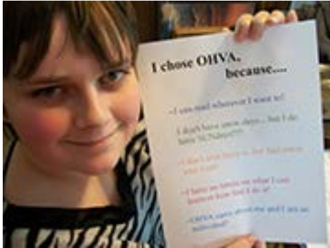
School Choice Reasons OHVA 12-13