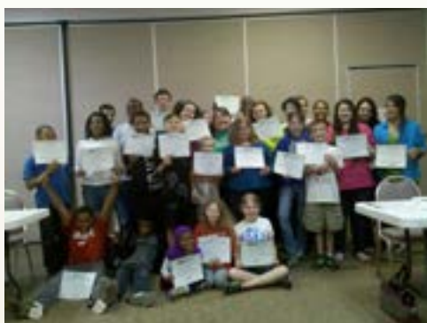
What could be better than bowling and a year-end pizza party?