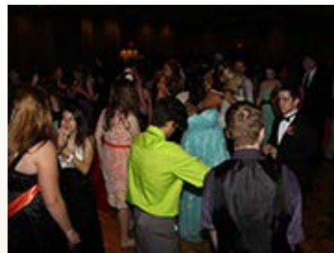
Spring Dance 2013 Group

Ohio Virtual Academy is proud to boast of the accomplishments and dreams of our students. We consider it an honor to partner with them and we celebrate their successes as they pursue their bright futures.