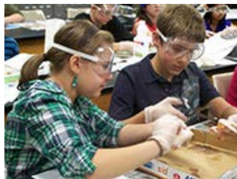
Middle School Science Workshops